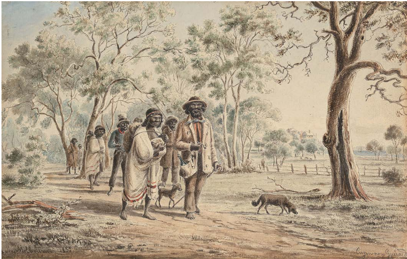
Fig. 9: Eugene von Guérard, 'Aborigines outside Melbourne', 1855