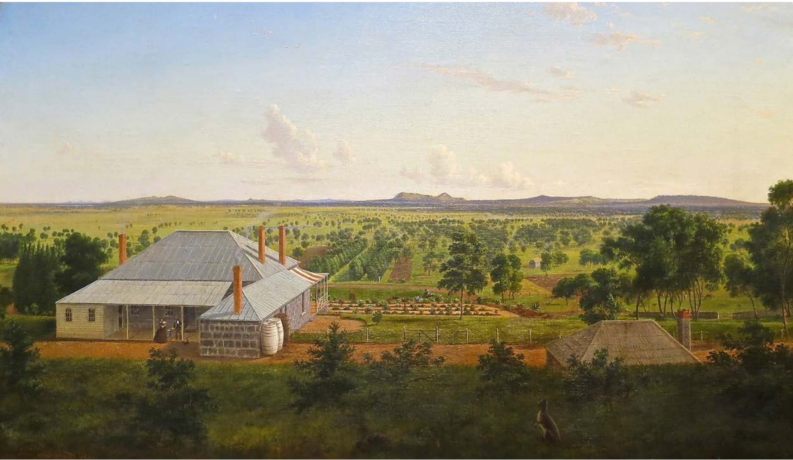
Fig. 15: Eugene von Guérard, 'Meningoort', 1861