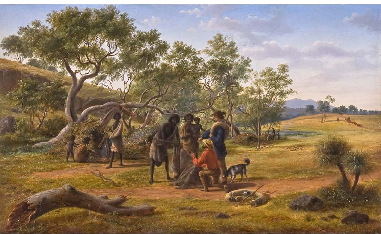
Fig. 3: Eugene von Guérard, 'Aborigines met on the road to the diggings', 1854

In von Guérard's composition the accepted order of colonial race relations is inverted: the miner kneels – ostensibly to examine the rug – while the standing Wathaurong man is evidently in command of the negotiations. Under the watchful eye of his female companion and with his grip on the rug firm, it seems unlikely that the miner's offer of £3 – as indicated by a raised thumb and two fingers – will be accepted. At the time good quality cloaks and rugs could fetch four or five pounds. 7