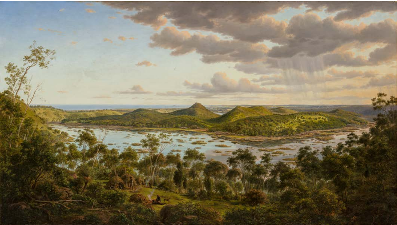
Fig. 11: Eugene von Guérard, 'Tower Hill', 1855

cal Museum, was almost certainly purchased from the people he met there. 56 It was probably the first cultural object to enter the collection of thirty significant cultural objects that he acquired over the following years. 57