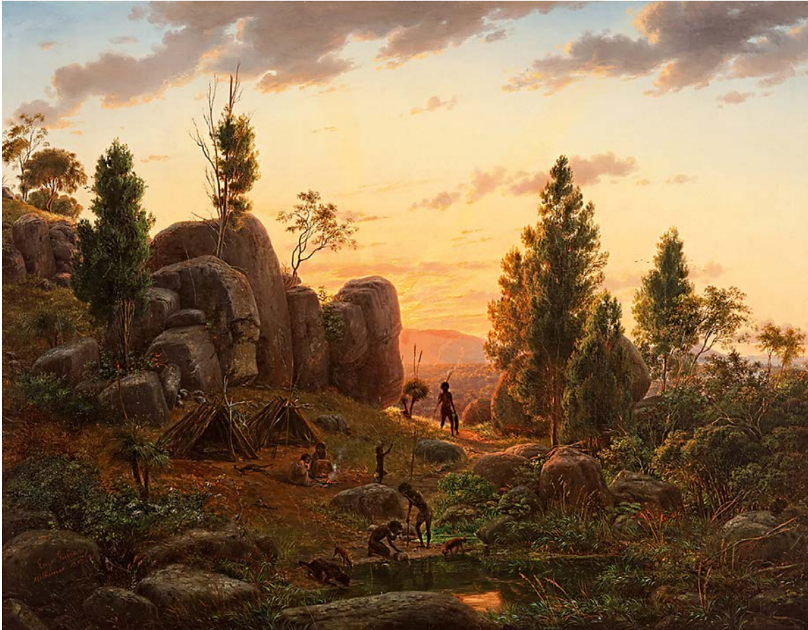
Fig. 16: Eugene von Guérard, 'Stony Rises, Lake Corangamite', 1857

in the landscape. The Djargurdwurrung people that von Guérard had seen at Meningoort in 1857 were erased from this view of claimed and colonised country. 74