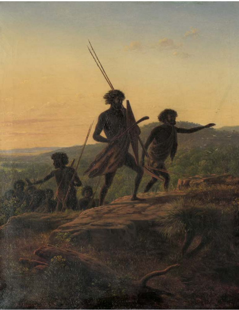
Fig. 6: Eugene von Guérard, [Aborigines in pursuit of their enemies] 'Native chasing game', 1854

The animated interplay of expression and gesture between the jostling warriors behind them, like the chorus in a Greek play, underscores the drama of the moment. Von Guérard had seen the way his influential Düsseldorf School contemporary Carl Friedrich Lessing had, in works like 'Riflemen Defending a Narrow Pass' 1851, intensified the focus on the most dramatic moment of a narrative by reducing the elements around it. 33 Here, like Lessing, von Guérard brought the warriors up close to the picture plane while pushing the generalized forms of the landscape back into the distance. In its heroic and elegiac tone, it recalls Emanuel Leutze's treatment of a similar theme in 'Last of the Mohicans' 1849/1850, a work which was painted and exhibited in Düsseldorf prior to von Guérard's departure for Australia in August 1852. 34 The nobility of the great Native American chief on his rocky pedestal is emphasized by the low viewpoint, and the fading light of day alludes, metaphorically, to what, it was believed, was soon to be lost. In the