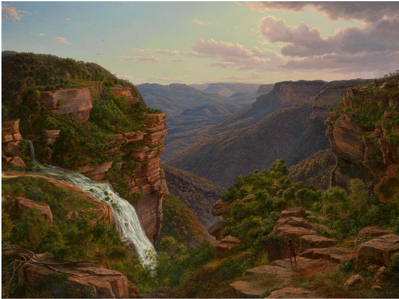
Fig. 7: Eugene von Guérard, 'Weatherboard Creek Falls, Jamieson's Valley, New South Wales', 1862

1862 (Fig. 7). In the painting, the Aboriginal man is located in, and identified with, an ancient, elemental and ostensibly pre-contact landscape. By contrast, the European tourist-travellers who contemplate the identical view in the 1867 lithograph, 'The Weatherboard Falls' (Fig. 8), exist in the present, having probably just walked the short distance from the Weatherboard Inn where visitors to the site – including Charles Darwin in 1836 – had stayed from as early as 1830. For educated mid-century travellers the awe-inspiring panoramic vista framed by massive, eroded sandstone cliffs spoke of the recent discovery of deep geological time, the magnitude of which is here metaphorically suggested by the unfathomably deep valley that yawns below them.