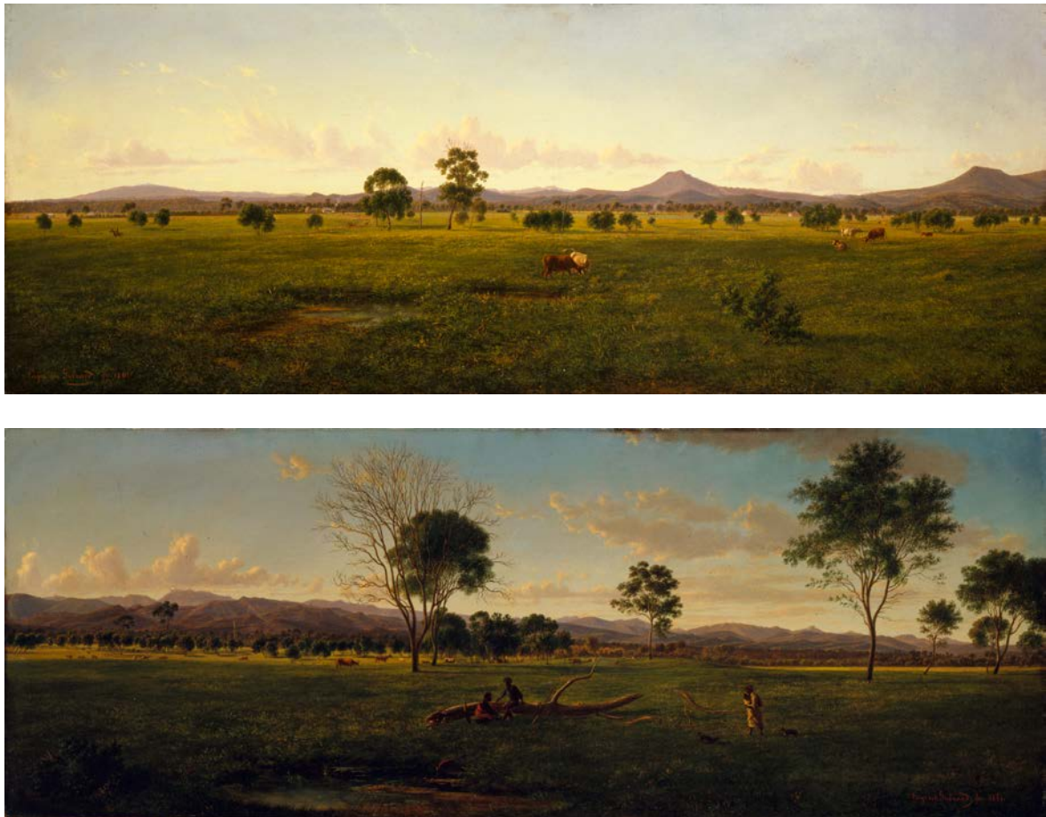
Eugene von Guérard, 'View of the Gippsland Alps, from Bushy Park on the River Avon', 1861