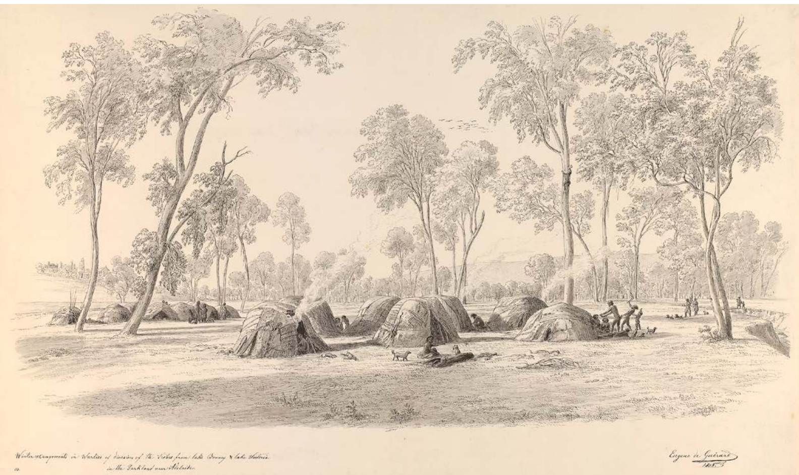
Fig. 10: Eugene von Guérard, 'Winter encampments in wurlies of divisions of tribes from Lake Bonney and Lake Victoria in the parkland near Adelaide', 1858