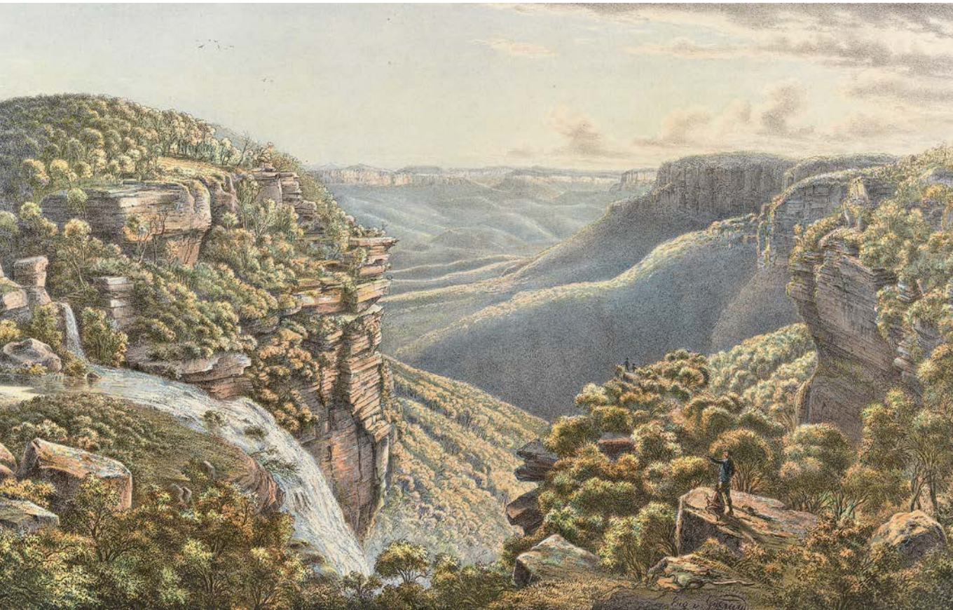
Fig. 8: Eugene von Guérard, 'The Weatherboard Falls' 1867