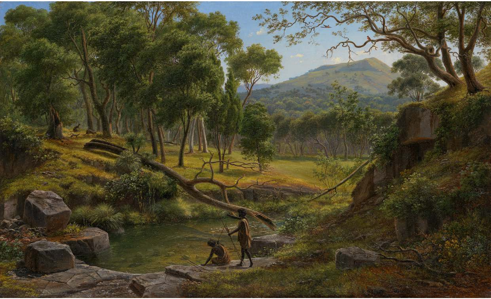
Fig. 5: Eugene von Guérard, 'Warrenheip Hills near Ballarat', 1854